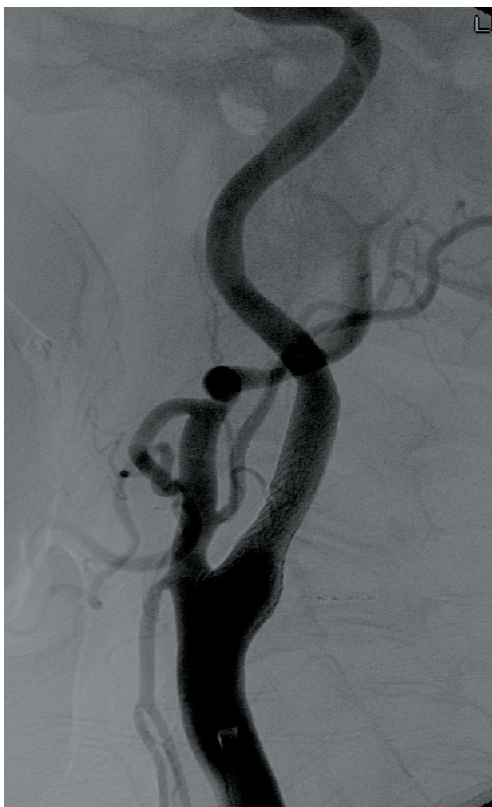
Figure 1 (Top) shows severe blockage of a carotid artery. Figure 2 (Bottom) shows the carotid artery after successful stent placement